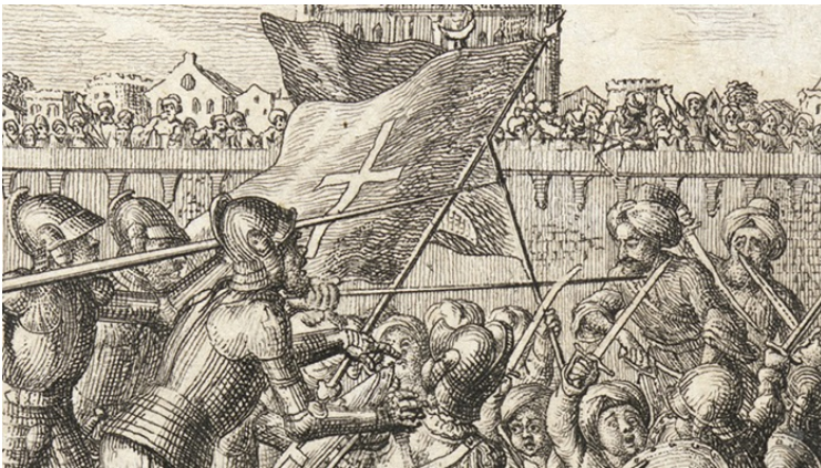
Crusades

1095 The Crusades: Pope Urban II preached against Muslims, and exaggerated their anti-Christian acts. He urged Christians to go to war 'for the Sepulchre'. Over 60,000 Crusaders went through Europe 'converting' people to Christianity at the point of the sword. Thousands were killed. The campaign was completed in July, 1099, when they took over Jerusalem, and massacred many of the city's Muslims and Jews. ( The Columbia Encyclopedia, 6th ed ).