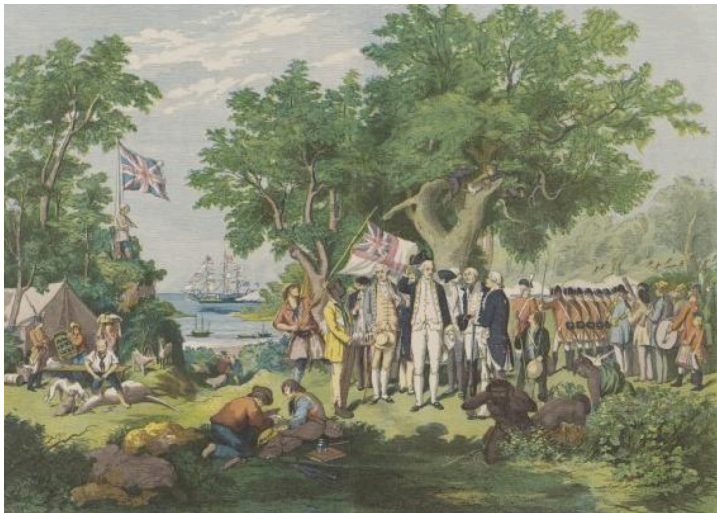
Captain Cook raises the Union Flag on Possession Island, 22 August 1770

Cook also wrote in the ship's log that same day: "We saw upon all the Adjacent Lands and Islands a great number of smokes—a certain sign that they are inhabited—and we have daily seen smokes on every part of the Coast we have lately been upon."